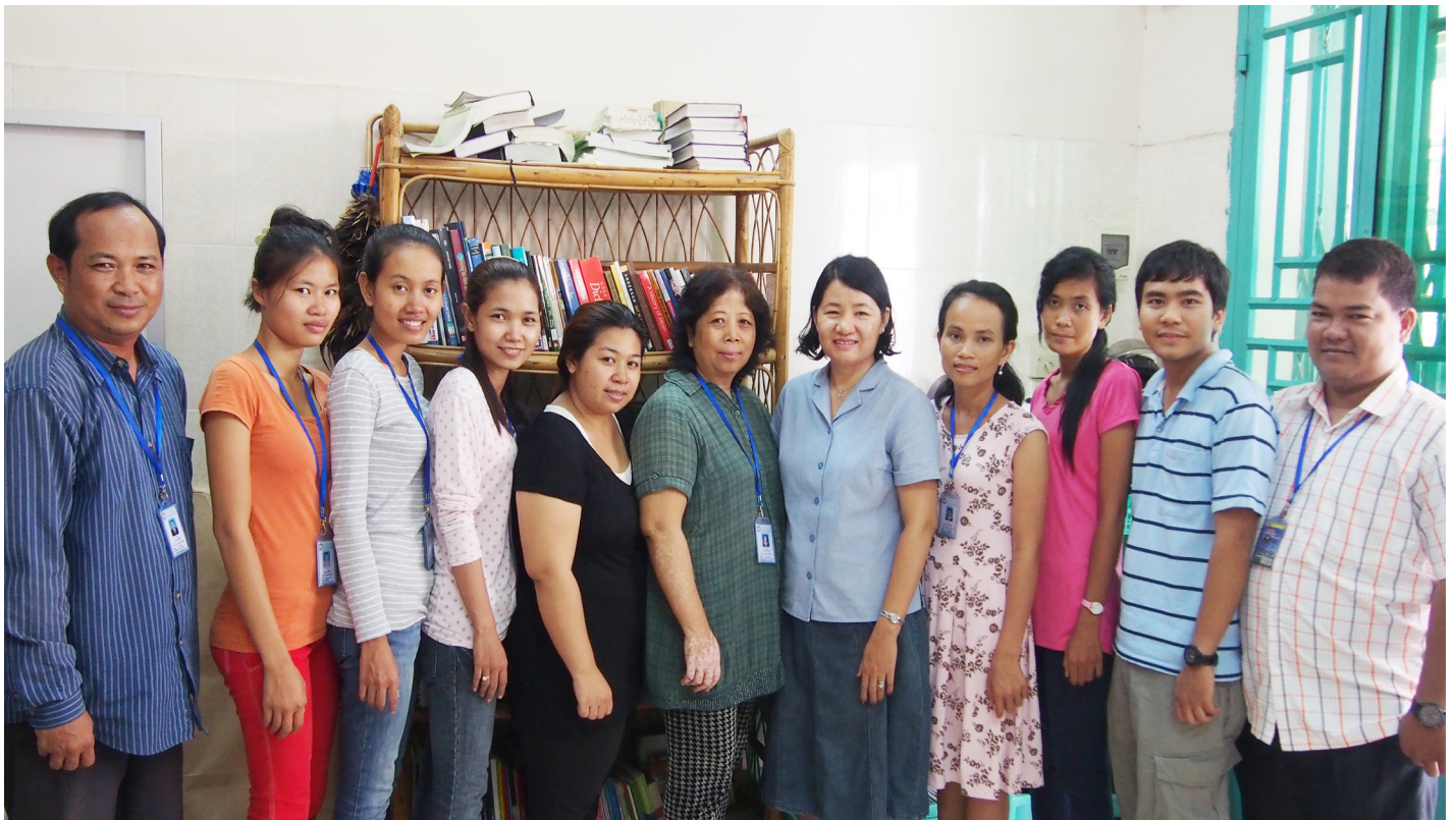
The Genesis Community of Transformation Staff.